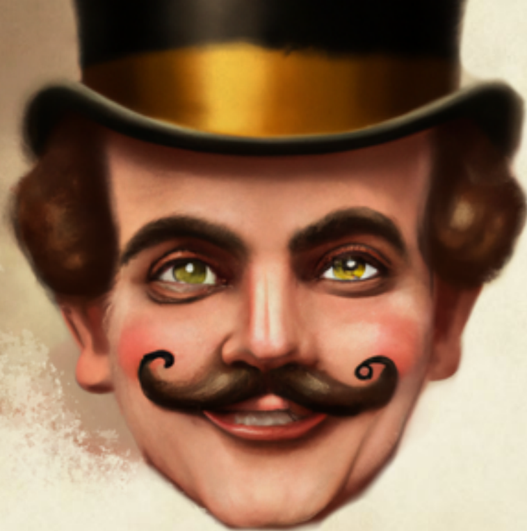
VONVAR VESCEGO DALL-E

Olo Diggle. A young female halfling who leads a group of prospective adventurers. She has her eye on the top prize and is willing to pay 3 gp per ticket for the remaining 12 tickets she needs.