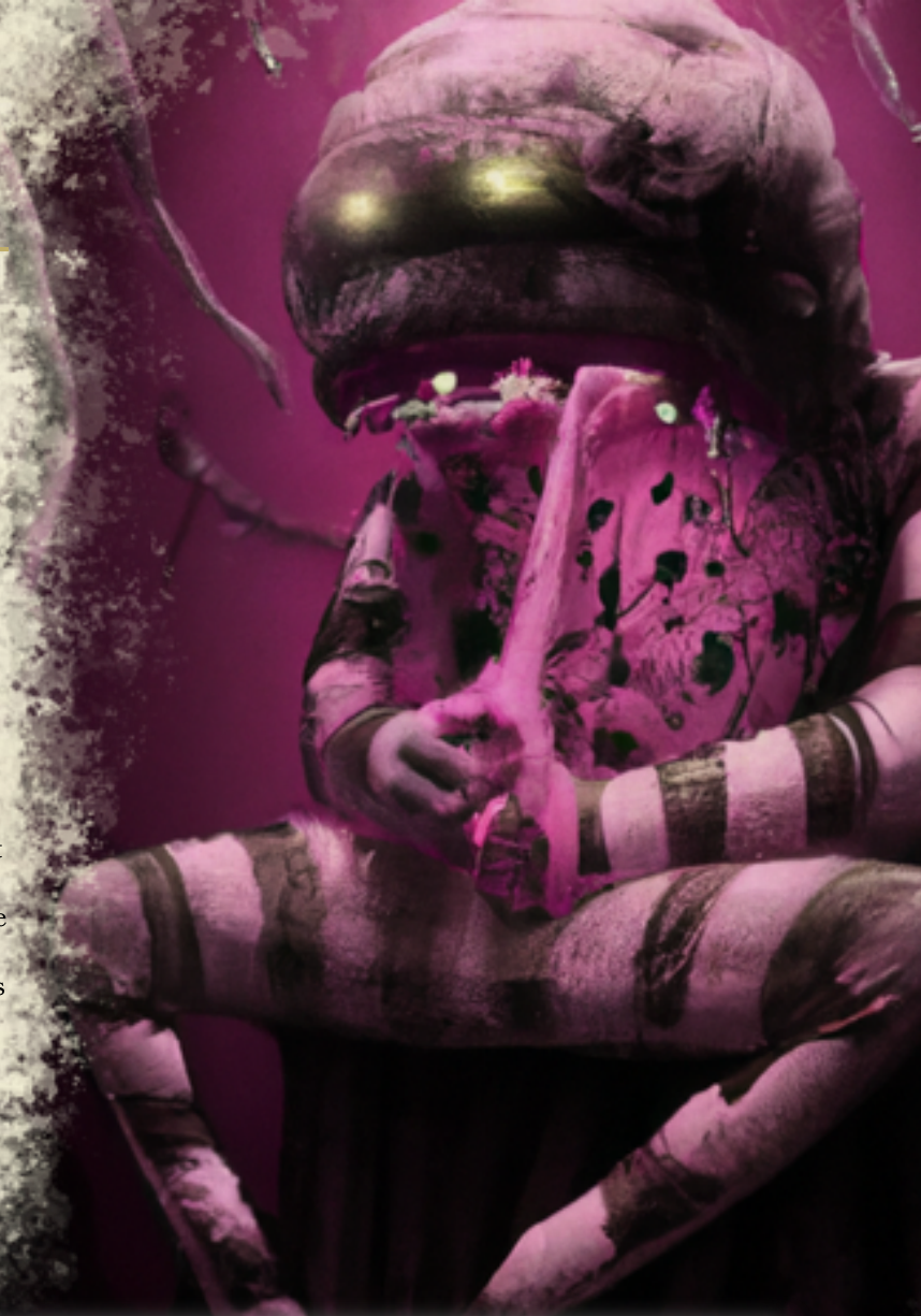
CARNIVAL CREEPER DALL-E

Creeper Skin. A carnival creeper's flesh retains some of its camouflaging capabilities even after death. As part of a long rest, if you have proficiency with leatherworker's tools, you can use your tools to combine the carnival creeper's remains and 100 gp in additional materials to create a special cloak. While worn, it grants advantage on Dexterity (Stealth) checks made to hide. The cloak loses this property 1d10 days after it was created.